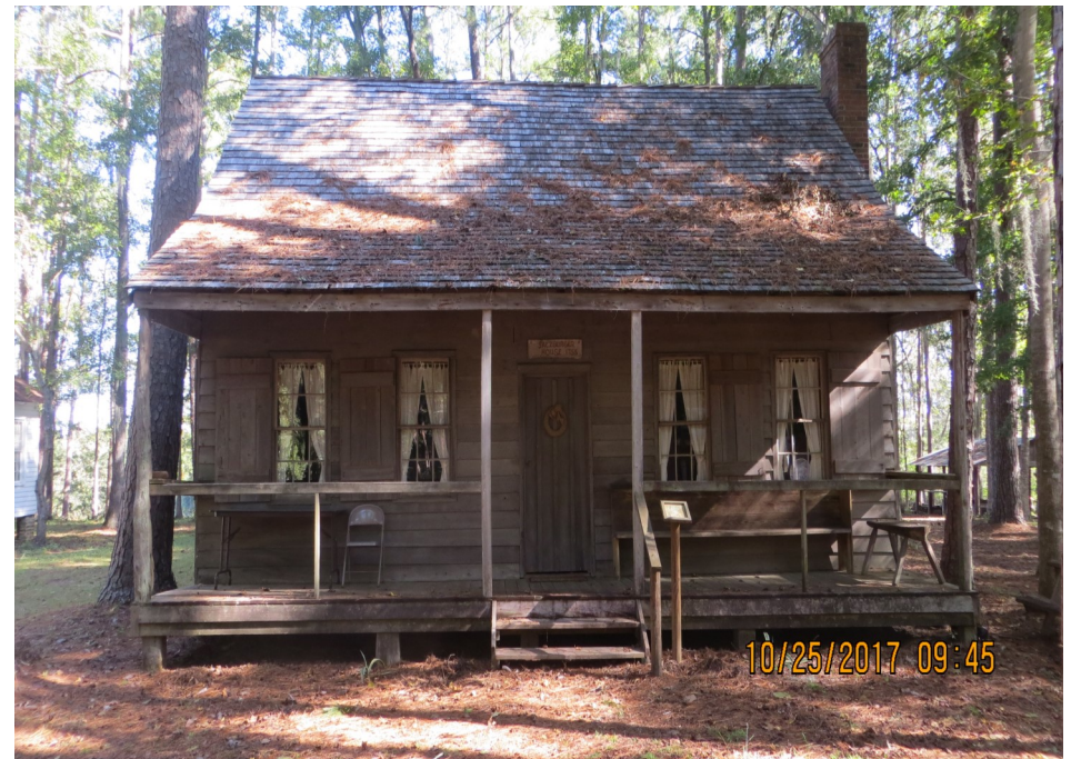
Below: Ye Olde Salzburger Haus, aka The Fail House, erected 1755.