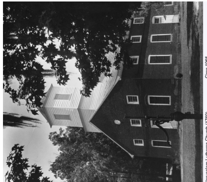
Jerusalem Lutheran Church (1769)