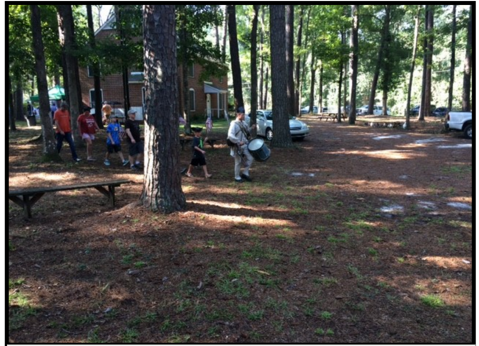
Above: Visitors participate in the a Revolutionary War interpretative activity presented by Coastal Heritage Society at Ebenezer during the Heritage Day Festival .