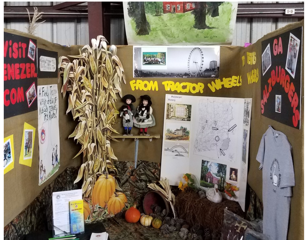
Above: GSS Exhibit at Effingham County Fair, which won First Place in the Community Service Category.

Please remember that all ongoing efforts to keep the Salzburger Saga alive and growing are made possible because of the generosity of members like you who are committed to preserving the irreplaceable heritage of Ebenezer. Let's ask, " What can we do to help? " With that being said, please strongly consider making a donation to the GSS Building and Grounds Fund.