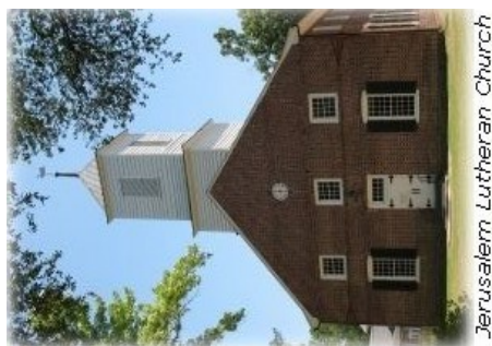
Jerusalem Lutheran Church