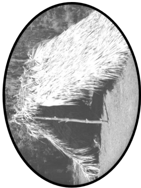
Grass Huts—type of dwelling the first Salzburgers used.